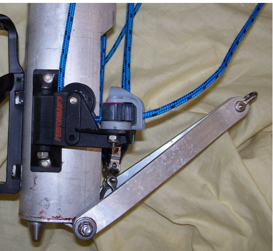
^ Keith Deed Mast Base & aluminium spanner (USA mast)