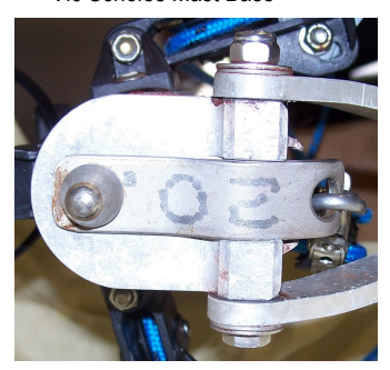
^ Keith Deed Mast Base (bottom)