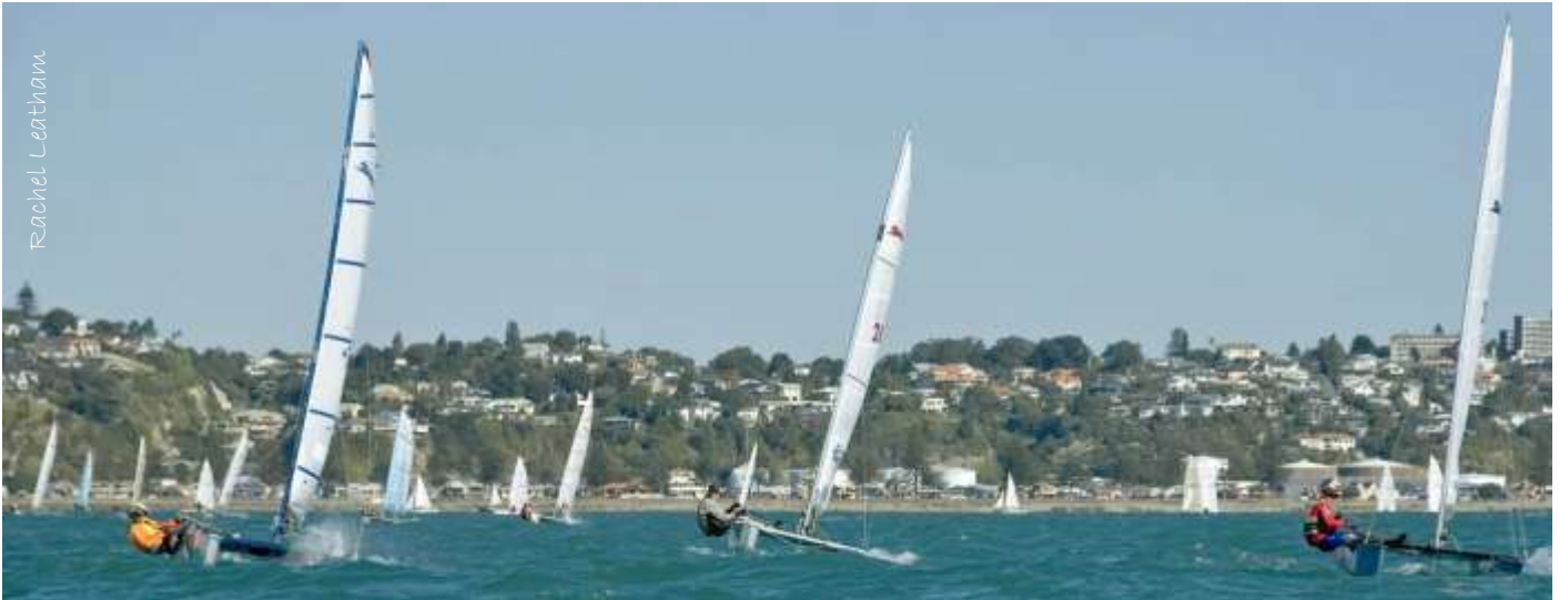
Ian leads the fleet to the windward mark

water, a lift off the headland, and possibly some tidal current to windward.