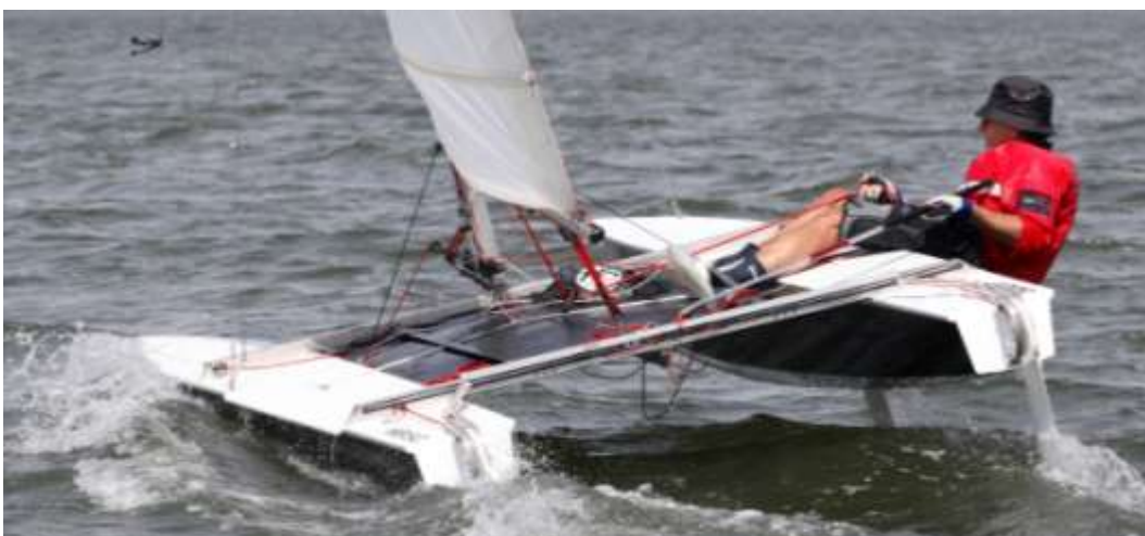
The editor and Solitaire