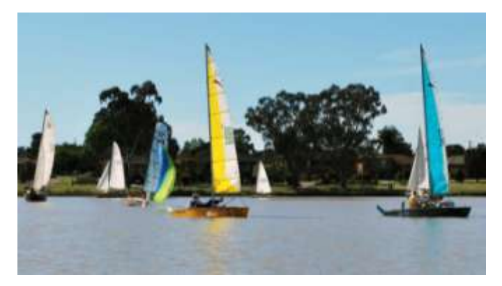
WAGGA WAGGA PRE-ALGAE